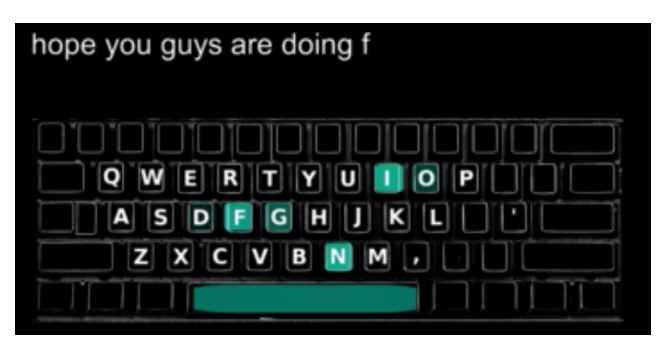
Figure 2. The virtual keyboard assistant as shown in the HMD.

the HMD to interact with the real world. However, such mixed reality methods add substantial software and hardware complexity, and poor imagery or self-occlusion can hamper effective user feedback.