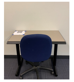
Figure 1: The testing location.