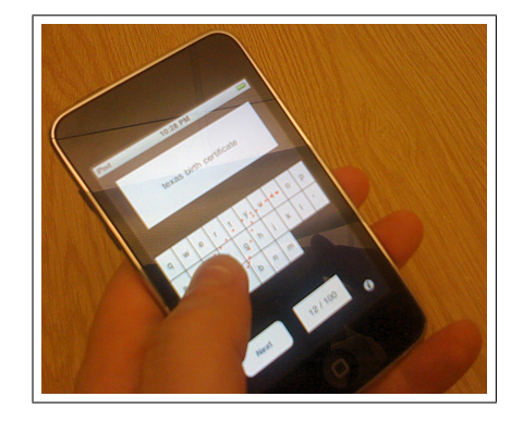
Figure 4: The iPod Touch gesture keyboard interface.

We first tested the merge model on complete utterances with gesture traces for every word in each utterance. The results are shown in table 1. Overall speech recognition (SR) was the least accurate modality with 27% WER. The gesture keyboard (GK) was much better at 14% WER and the scale-translation invariant version of the gesture keyboard (IGK) performed about the same (14% WER). We find it interesting that the scale-translation invariant version of the gesture keyboard had similar performance as the location-dependent version. We conjecture this is because location information can both aid and hinder recognition